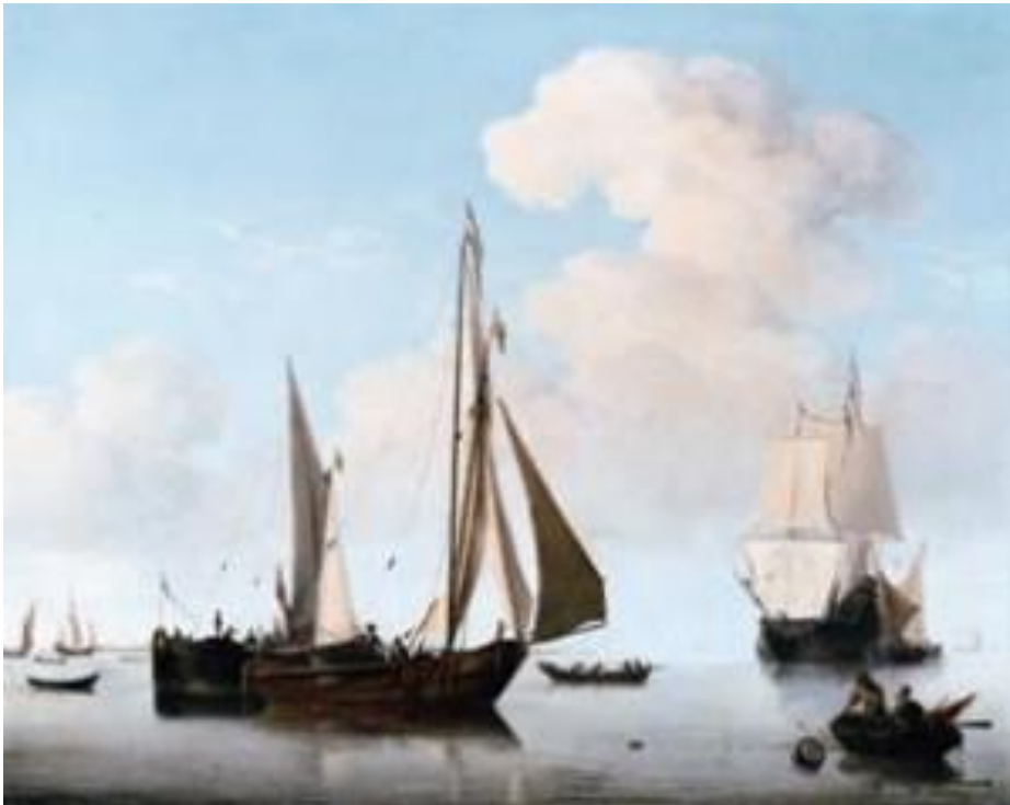
A Kaag and Smalchip Under Sail