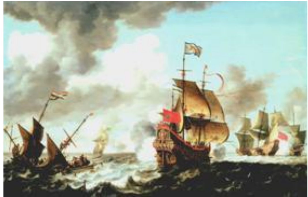
Dutch Naval Action